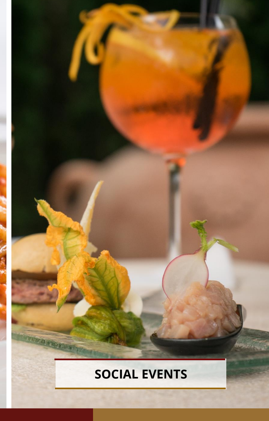
RELAIS LE JARDIN RESTAURANT